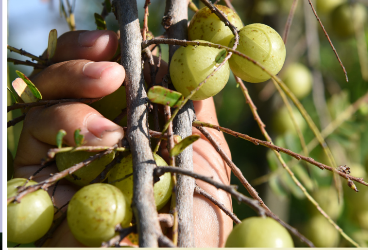
AMLA ORGANIC FRUIT